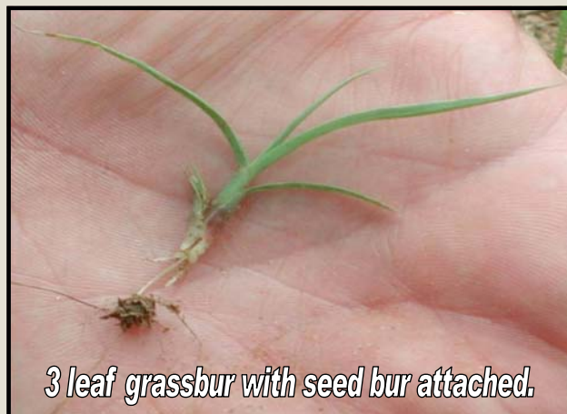
3 leaf grassbur with seed bur attached.

trol. You must keep hay fields scouted in the fall for grassbur presence so you are able to