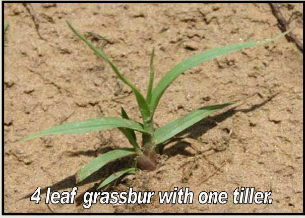
4 leaf grassbur with one tiller.

cult to eradicate, since they have already developed a substantial root system the previous year. Whenever you have a weak stand of