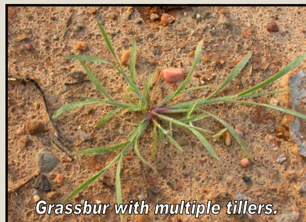
Grassbur with multiple tillers.

In the spring and throughout the summer, you should again scout the fields for early detection of grassbur and get postemergence treatments