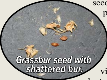
Grassbur seed with shattered bur.

seeds. This capsule provides a nice environment for the seed, soaking up soil moisture and holding it until the seed has been provided the other stimulants (warm temperatures, light, day length, etc.) necessary for germination.