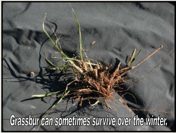
Grassbur can sometimes survive over the winter.

Grassbur (field sandbur, sandbur, etc.) is a troublesome, nasty grass weed species that affects desirable grass forage quantity and quality. Although young plants are often utilized as a grazing forage, when in the advanced stages of seed production this plant produces seed capsules that can penetrate tissues of animals causing pain and sometimes infection. More importantly, it has a very negative effect on hay quality and substantially reduces forage value. There are many different grassbur species in Texas although one of the more common is Cenchrus spinifex (formerly Cenchrus incertus ). Regardless, most are easily recognized in the mature stage of growth when the pernicious seed heads become apparent. What you may interpret as the seed is actually a seed “capsule” that usually contains from 1 to 3